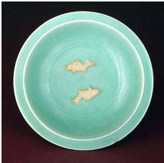
Dish with Two Unglazed Carp , 12th - 13th Century. Porcelainous ceramic with two unglazed carp and celadon glaze, Longquan type, 1 3/4 x 7 3/4 in. Gift of Ira and Nancy Koger, 2001. SN11122.39

For this art activity we will be making shiny rainbow fish using markers and aluminum foil! The aluminum foil not only makes the scales shiny, but gives it texture as well!