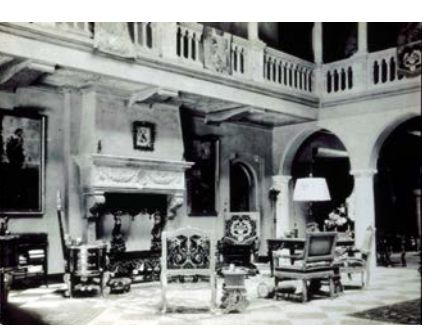
This photo was taken by Mable Ringling in the 1920s and shows how the furniture in the court was arranged.

The Court would also be buzzing with activity. The furniture in this room was arranged into smaller groupings where you could play cards or have conversations, so the