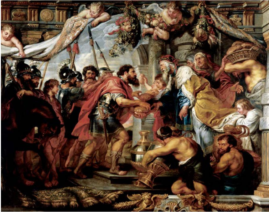
Peter Paul Rubens (Flemish, 1577 - 1640), The Meeting of Abraham and Melchizedek , c. 1625. Oil on canvas, 175 1/4 x 224 3/4 in. Bequest of John Ringling, 1936. SN212